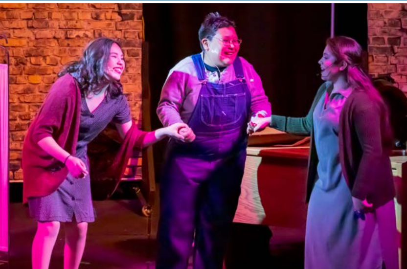
Theater and arts