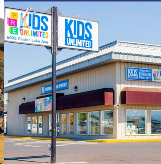
Preschool in White City opens. Read more on page 8.