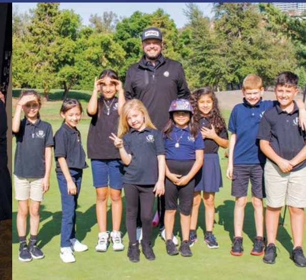
Golf academy debuts in 2022.