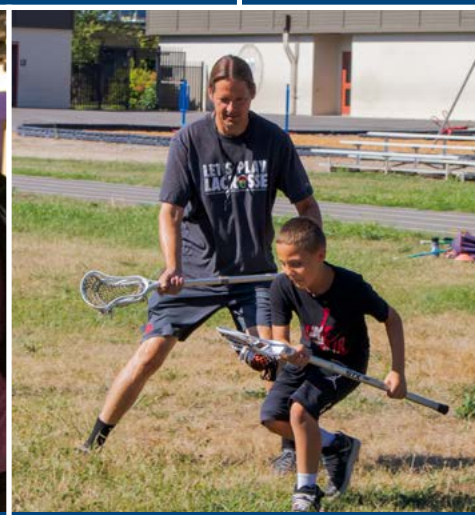
Team and individual sports