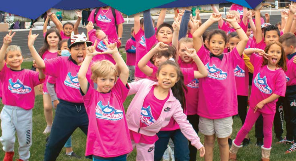
KUA school events

With your help, we know we can remove barriers and provide opportunities for empowerment. Together we can make a difference!