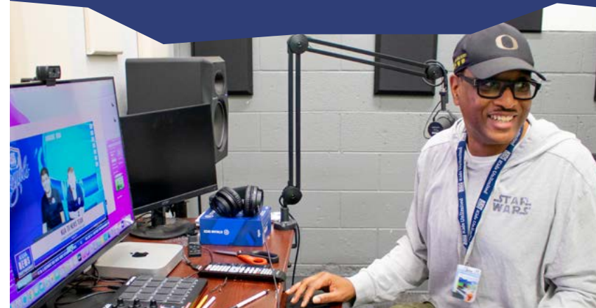
New recording/podcast studio opens. Read more on page 10.