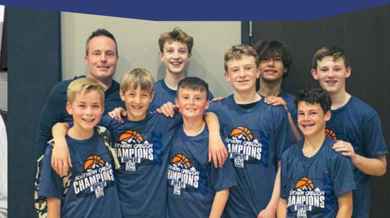
Southern Oregon Open basketball tournament returns.