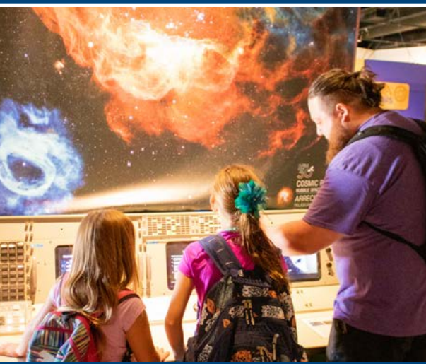
Educational field trips