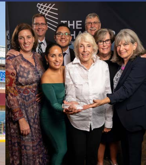
KU awarded Medford Chamber Excellence in Business.